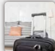
Hotel & Tourism