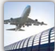
Public Utility & Transportation

Wisers 慧科 Advantage through Intelligence