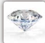
Luxury Brand & FMCG