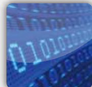
IT & Telecommunications