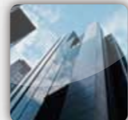
Property Development & Management